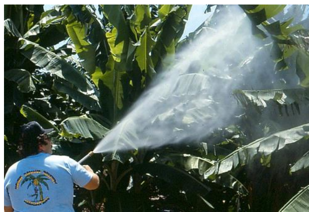
Figure 7: The application of synthetic pesticides, greatly contribute to greenhouse gas emission.

However, instead of appreciating the role of synthetic pesticides in climate change, it has ignorantly been presented as a mitigation strategy for climate change especially by industrial agriculturists [23]. Scientific evidence has shown that pesticide application significantly promotes greenhouse gas emissions (figure 7) while exposing our agricultural systems to more danger and vulnerability. Several oil and gas industries are key players in the development of pesticides and their ingredients [23]. Research has also revealed that it takes 10 times more energy to manufacture 1kg of pesticide than it takes for 1kg of nitrogen fertilizer [86]. Some pesticides are powerful greenhouse gases; an example is sulfuryl fluoride, which is 5,000 times more potent than carbon dioxide [87]. Diversification of agricultural systems in a way that increases ecosystem resilience may be useful in achieving sustainability and reducing climate impact on the ecosystem regardless of region [88].