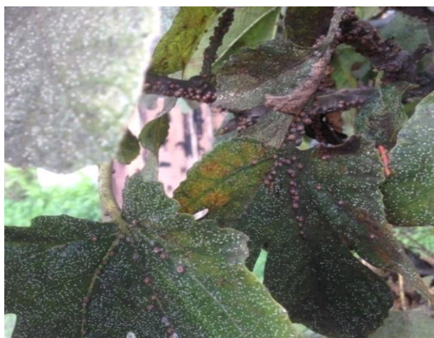
Figure 4: Higher temperatures and humidity increase metabolic and reproductive rates in pests

Temperature is a fundamental factor that determines the performance of pesticides. Some pesticides are designed to work within specific temperature ranges. Higher temperatures may accelerate the rate of metabolism resulting in increased feeding and reproduction rates (figure 4). This could potentially require higher pesticide application rates or more frequent treatments to achieve effective pest control.