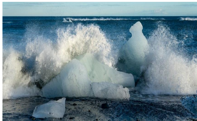
Figure 2: Melting ice caps and glaciers resulting from global warming

The melting of ice caps and glaciers is a direct consequence of global warming (figure 2). This increases sea levels in coastal cities, as well as increases the risk of damage to life and properties from flooding.