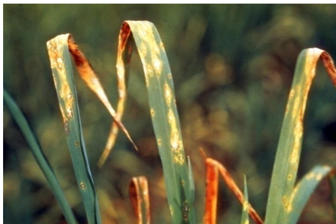
Figure 6: Increase in pest infestation due to altered dynamics

Climate change can affect the distribution and abundance of pests. Rising temperatures and changing rainfall patterns can create more favorable conditions for certain pests, leading to increased infestations. Conversely, some pests may decline in certain regions due to unsuitable conditions. Pesticides that were effective in the past may become less efficient or ineffective against new pest populations [53]. Climate change can also result in the expansion or contraction of pest and disease ranges. As a result, pests that were previously absent or less problematic in certain areas may become more prevalent. This can create new challenges for pest management, as different pest species may have varying susceptibilities to available pesticides [53]. Increased temperature and unstable precipitation patterns can affect the timing and intensity of pest outbreaks, making it challenging to apply pesticides effectively [54].