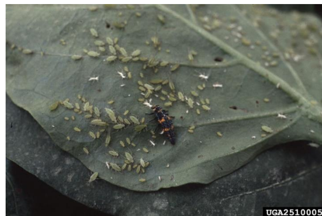
Figure 5: Increased temperature and moisture increases pest infestation, while reducing pesticide efficacy

The presence and availability of pesticides in the soil is highly controlled by climate change variables, such as; temperature and soil moisture. Climate change can alter precipitation patterns, which can directly influence the effectiveness of pesticides.