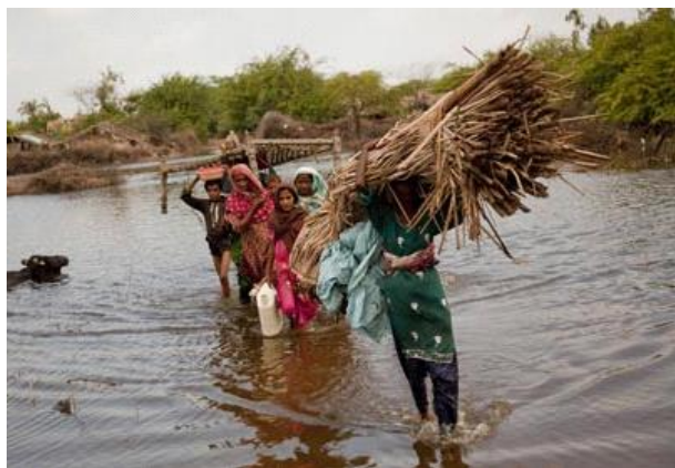
Figure 1: The impact of excessive flooding, on agricultural farmlands.

Since about 80% of the world's agricultural land is rain-fed, global crop yield is highly dependent on precipitation patterns and could be greatly affected by changes in precipitation and the attendant increase in pest pressure that arises thereafter [45]. This can result in increased pesticide use, economic losses, and potential environmental pollution. Increased precipitation can also cause flooding (figure 1) which reduces the population and activities of earthworms, thus decreasing crop resilience to diseases and pests, as earthworms are very beneficial for healthy soils [46]. According to Plum [47], the abundance, diversity, and biomass of various groups of soil organisms in grassland is reduced abundantly during flooding incidences. Also, high rainfall patterns accelerate the leaching of cations which further aggravates soil acidification [48].