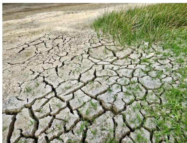
Figure 3: Fragmentation of agricultural farmlands due to excessive drought conditions.

As a result of climate change, extreme weather events, such as hurricanes, droughts (figure 3), and heatwaves are grossly intensified. Also rising temperatures are causing regular and severe heat waves around the globe.